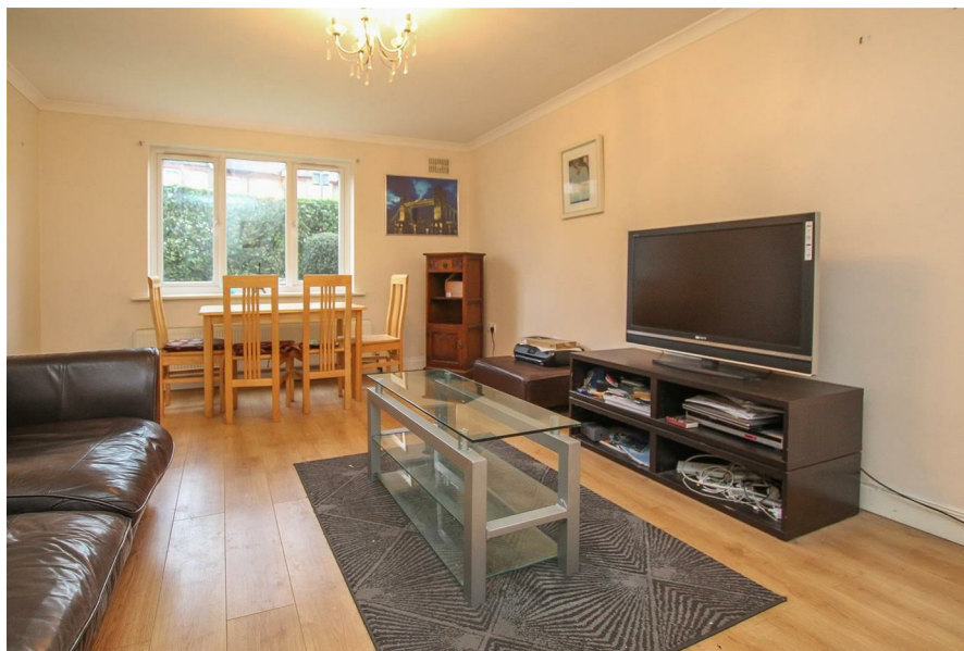
Flat 7 Cornsland Court Rose Valley, Brentwood, CM14 4HY

TOTAL APPROX. FLOOR AREA 586 SQ.FT. (54.4 SQ.M.) THIS PLAN IS FOR ROOM IDENTIFICATION ONLY, AND ITS ACCURACY IS NOT GUARANTEED. www.epcsinsex.co.uk Made with Metropix ©2018